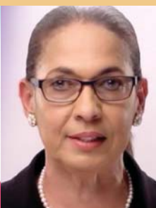
Honourable Shahine Robinson Minister of Labour & Social Security